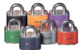
Optional Color Coded Jackets