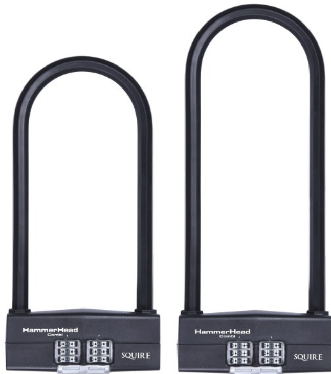
hammerhead™ 290 combi