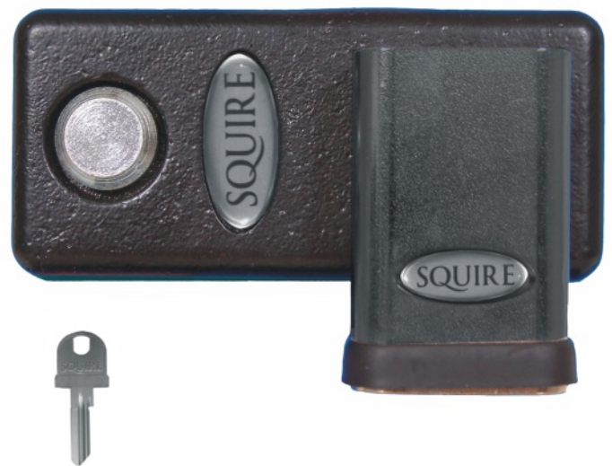
K series Standard Cylinder KA, KD & MK

Trucks, vans, gates, doors, garage, storage areas