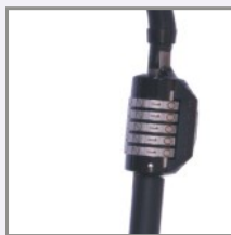
2. pull body back