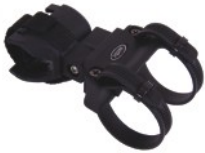
snaplok carrying bracket