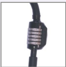
1. dial in code