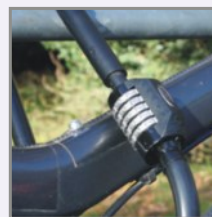
4. secure item to fixed object