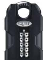
SS50CS Combi Closed Shackle