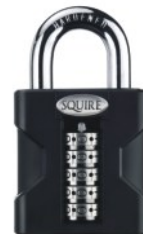
SS50S Combi Open Shackle