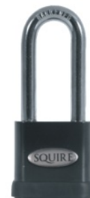
SS50S 2.5 Long Shackle